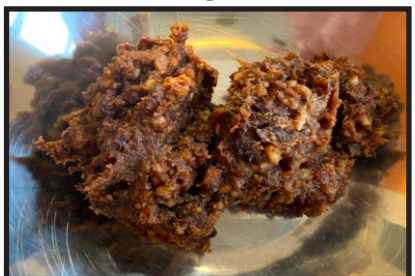
Make the mixture into small balls with your hands.