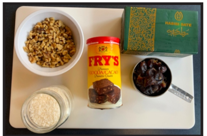
1 cup walnuts 1 cup dates (with the pits taken out) 2 tablespoons cacao powder ½ cup unsweetened shredded coconut