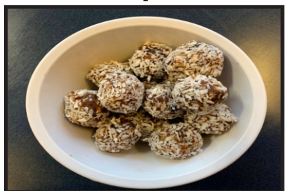
Put the shredded coconut into a bowl and toss each of the energy balls in and coat them with the coconut.