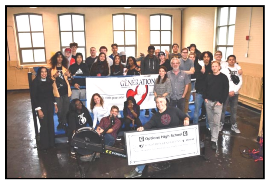
24 Hour Row Raises $3,595 For The Montreal Generations Foundation

December 2019 Montreal, Quebec Issue #1 Page 1 of 11